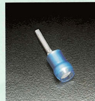
STYLE G Flared Nylon Insulation + A.V. Sleeve Prefix FNDWS