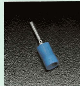
STYLE D Flared Vinyl Insulation Prefix FVWS