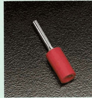
STYLE B Straight Vinyl Insulation Prefix VWS