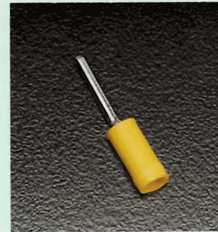
STYLE C Straight Vinyl Insulation + A.V. Sleeve Prefix VDWS