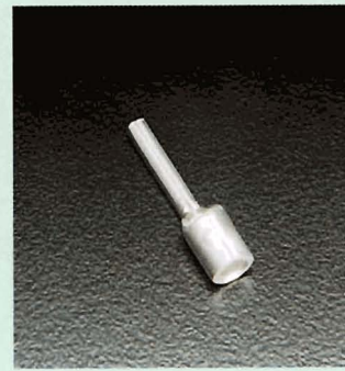
STYLE A Uninsulated